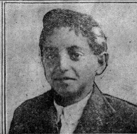
FOUR YOUNG VICTIMS OF TEWKSBURY BOAT ACCIDENT WHO LOST THEIR LIVES IN ROUND POND.